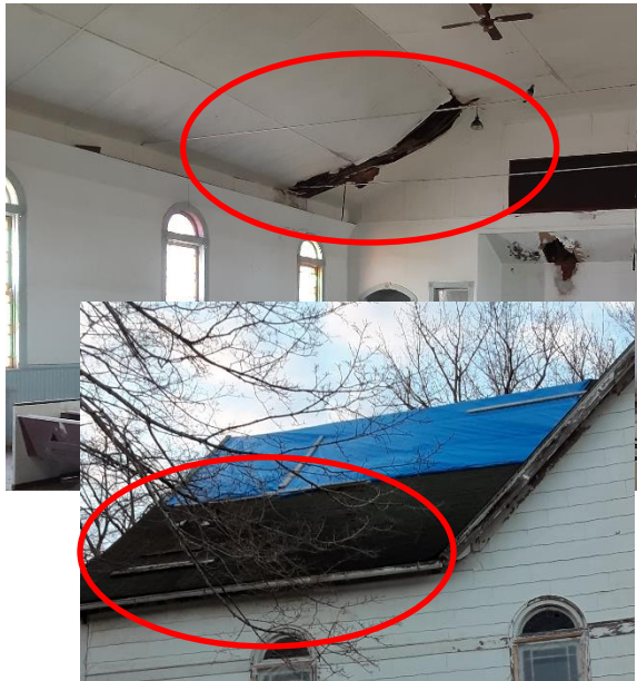
Location of roof & ceiling damage (Photo of roof was taken in 2019)

The successes of our fundraising tours have funded plans for significant progress on renovations during 2025. Construction estimates have been obtained for installing restrooms and an office in the existing Southeast addition behind the sanctuary, however the first priority is to stabilize and repair the sanctuary ceiling damage that continues to deteriorate. This is to prevent the ceiling from dropping and causing more damage below.