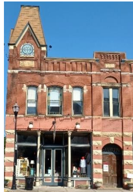
501 Roane St, Notably reflecting "SMITH" under the Corner Tower and "1891" in Center of Parapet