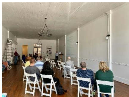
Photo from previous CHHCO Annual Meeting. The Annual Meeting includes presentation of the past year's accomplishments as well as goals for new year, and opportunity for public input

In addition, a Community Pot-Luck Dinner is added to this Annual Event to further enjoy CHHCO fellowship in the wonderful Gates Hall environment! CHHCO will provide drinks, Board Members will bring meat and main entrée items, and other attendees are asked (but not required) to bring a side dish or dessert to share. Please plan to join us, and invite your neighbors and friends for this Annual event!