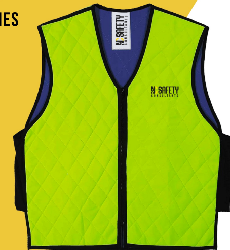
NCS-COOLING VEST-GCC2024-1- LIME