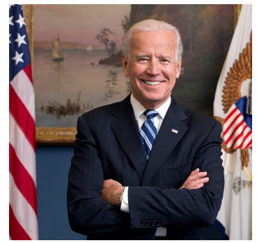
Joseph. R. Biden Jr.

Across the generations, countless Black Americans have demonstrated profound moral courage and resilience to help shape our Nation for the better. Today, Black Americans lead industries and movements for change, serve our communities and our Nation at every level, and advance every field across the board, including arts and sciences, business and law, health and education, and many more. In the face of wounds and obstacles older than our Nation itself, Black Americans can be seen in every part of our society today, strengthening and uplifting all of America.