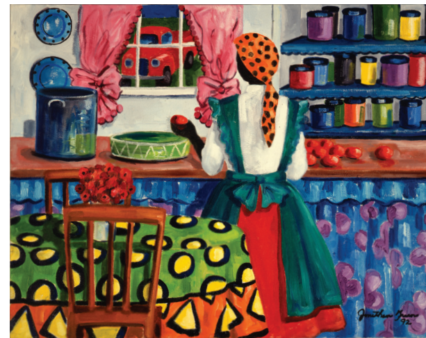
Red Tomatoes , 1992, Oil on Canvas, 16" x 10" © Jonathan Green

Claiming Your Health by Claiming Your History