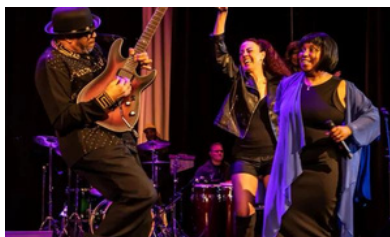
Lady of Song