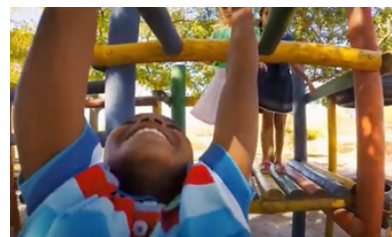
Kids That Roc