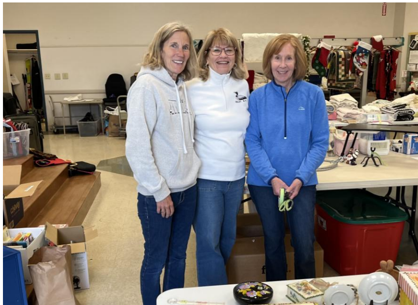
Friends, and members of Christ Church since they were children!