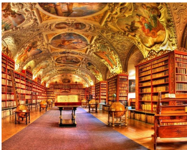
Our library won't look like this but...maybe it could!