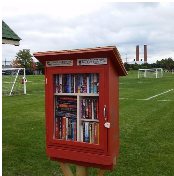
Just an example. Our Free Little Library looks way cooler.

Want to help? We’re currently looking for donations. The “Free Little Library” needs some gently used books for all ages. They do not have to be religious in nature, but please consider the library’s audience: our neighbors. We want this community library to do a bit of “evangelization” so that our neighbors see us as welcoming, loving, and joyful!