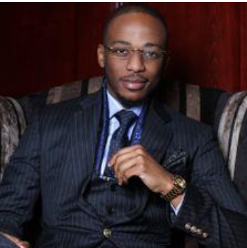
H.E Amb Tal Edgars PHD (Canada)