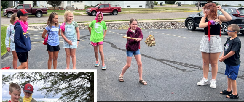
Above—breaking the “Golden Calf” piñata.