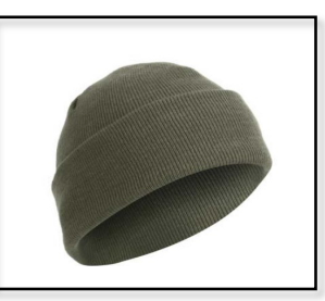
- Winter Watch Cap -