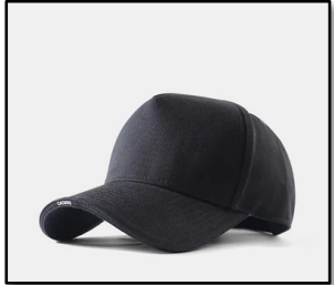
- Standard Baseball Cap-

Tactical Supply Network is proud to serve as a distributor for Legacy Safety's ultimate Bulletproof Baseball Hat Insert . Engineered for unmatched safety without compromising comfort or style, this innovative headgear insert offers discreet ballistic protection suited for everyday wear. This lightweight multi-hit hat system offers Level II ballistic protection. (9mm, 45ACP, 40 S&W, and .38 Special rounds). Whether you are a civilian seeking added security or a member of law enforcement operating with discretion, this baseball hat provides an essential layer of protection.