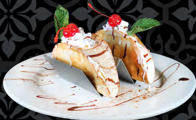
ICE CREAM TACO 9.36