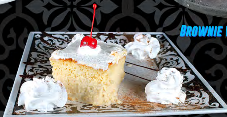
TRES LECHEs CAKE 9.36