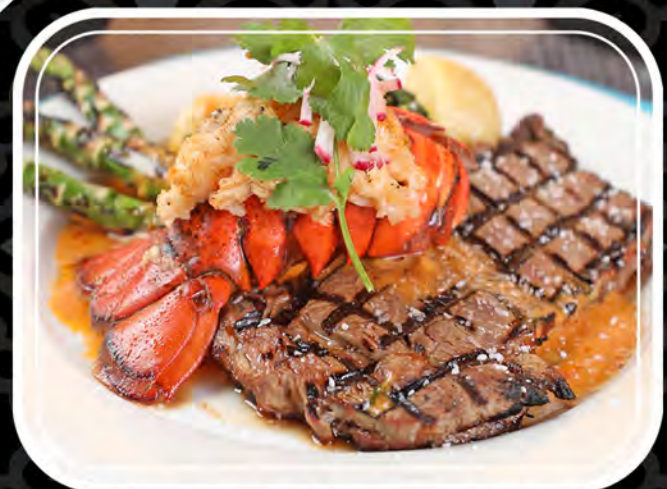
LA VIDA SIGUE

WE OFFER DISCOUNT TO ALL CUSTOMERS PAYING WITH CASH