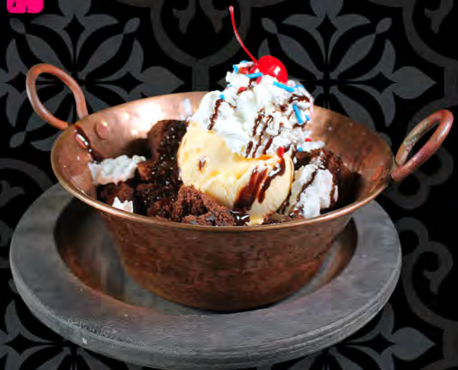
BROWNIE WITH ICE CREAM 9.36