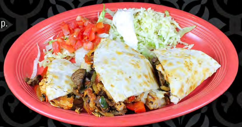
FAJITA QUESADILLA TEXAS STYLE

WE OFFER DISCOUNT TO ALL CUSTOMERS PAYING WITH CASH