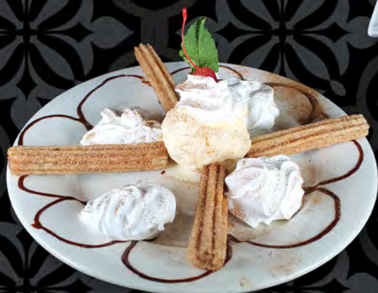
CHURROS WITH ICE CREAM 9.36