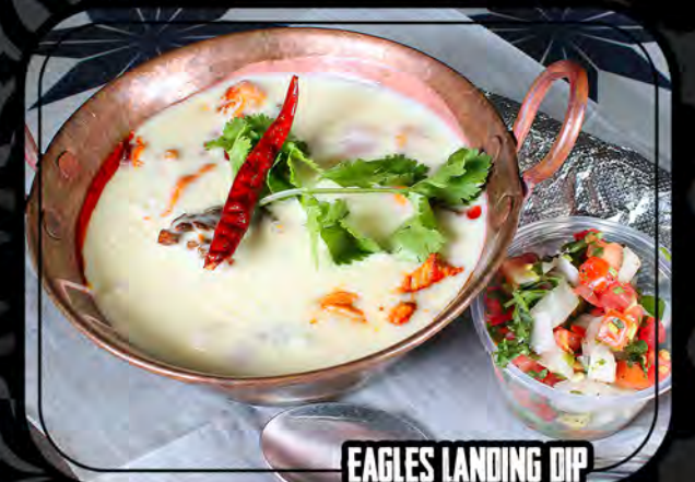
EAGLES LANDING DIP

A bed of tortilla chips topped with white cheese dip covered with chunks of chicken, beef and beans all topped with lettuce, tomatoes and sour cream. 17.68