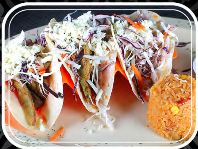
FRIED AVOCADO TACOS