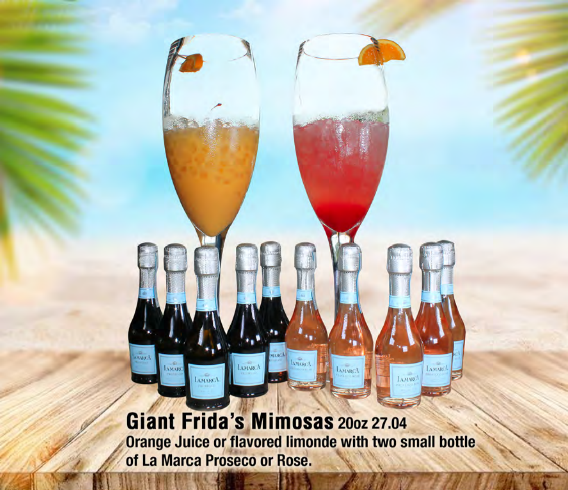
Giant Frida's Mimosas 20oz 27.04 Orange Juice or flavored limonde with two small bottle of La Marca Prosecco or Rose.