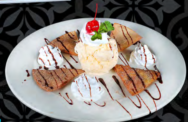
SOPAPILLA WITH ICE CREAM 9.36