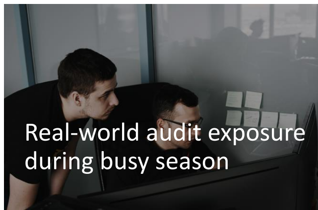
Real-world audit exposure during busy season

By the end of the season, the fellow felt inspired to pursue their CPA, recognizing accounting as an impactful career path. The firm not only benefited from the fellow's enthusiasm and support during their busiest time of the year but also built a potential future hire, gaining a positive reputation as a place where aspiring professionals grow and thrive.