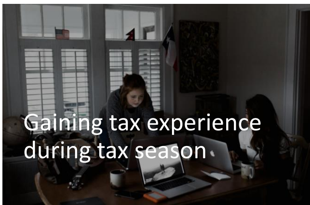
Gaining tax experience during tax season

A sophomore economics major seeking hands-on experience in tax joined a regional accounting firm through Picky Fellowship. With tax season underway, the fellow took on crucial tasks, including organizing client records, preparing initial tax return drafts, and reviewing documents for compliance. Initially uncertain about a career in accounting, this exposure allowed them to understand the essential role accountants play in guiding clients through complex tax obligations.