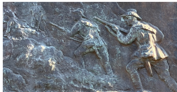
The two brass panels on the pillar depicting the landing at Gallipoli and the Light Horse in Palestine inscribed with locations where Maryborough soldiers served during World War One.