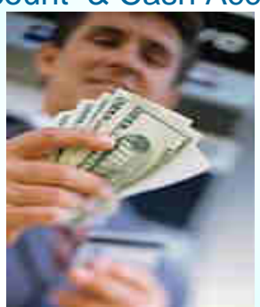
Money $tation "CA-CB"