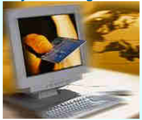
Money $tation "POS"