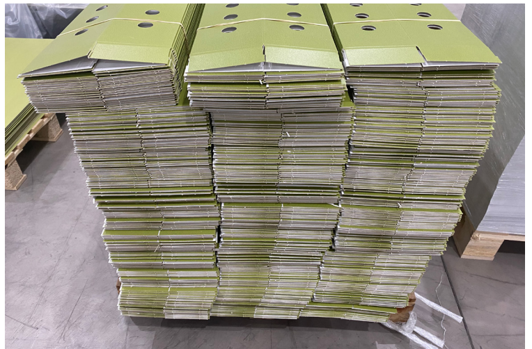
REDUCE TRANSPORT COSTS: Supplied flat-packed, which means we can fit up to 2000 units per pallet.