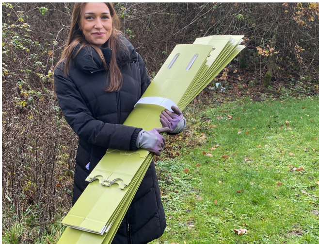
EASY TO CARRY: Lightweight and easy to move out to planting sites.