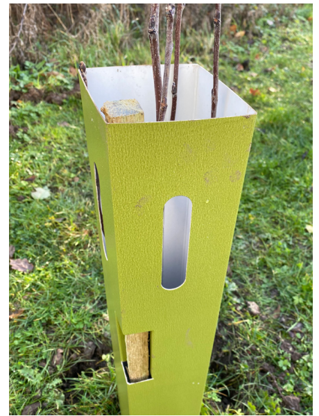
STAKES: Simple to use staking system which can be popped into place.