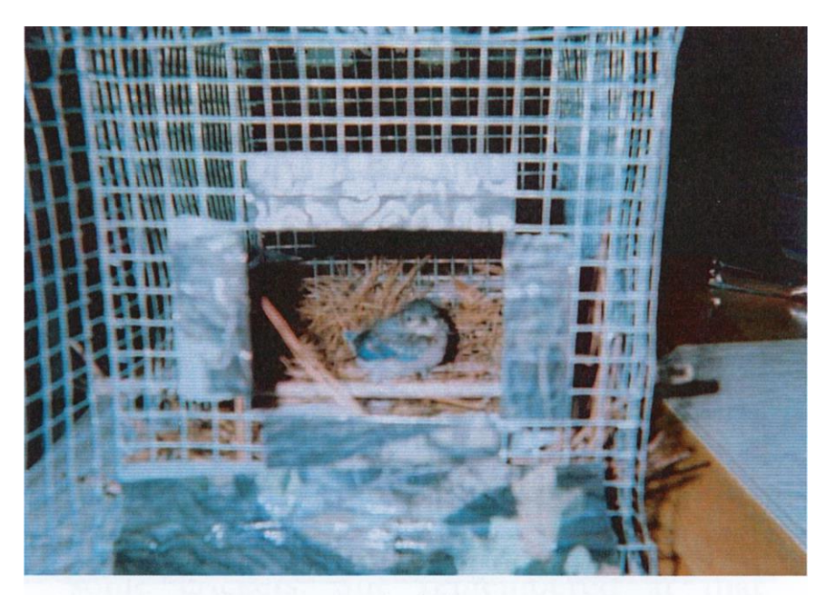
Blue Boy in his hardware cloth home, where he lived until he was taken to Carolina Wildlife.