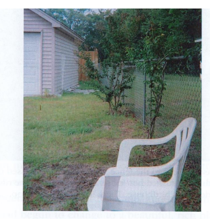
The trees back across the pasture where I heard Blue Boy chirping on his way back home. He came over the fence onto a low limb, where "Mr. Human" just stooped down and picked him up. "Mr. Human" was sitting in the white chair.