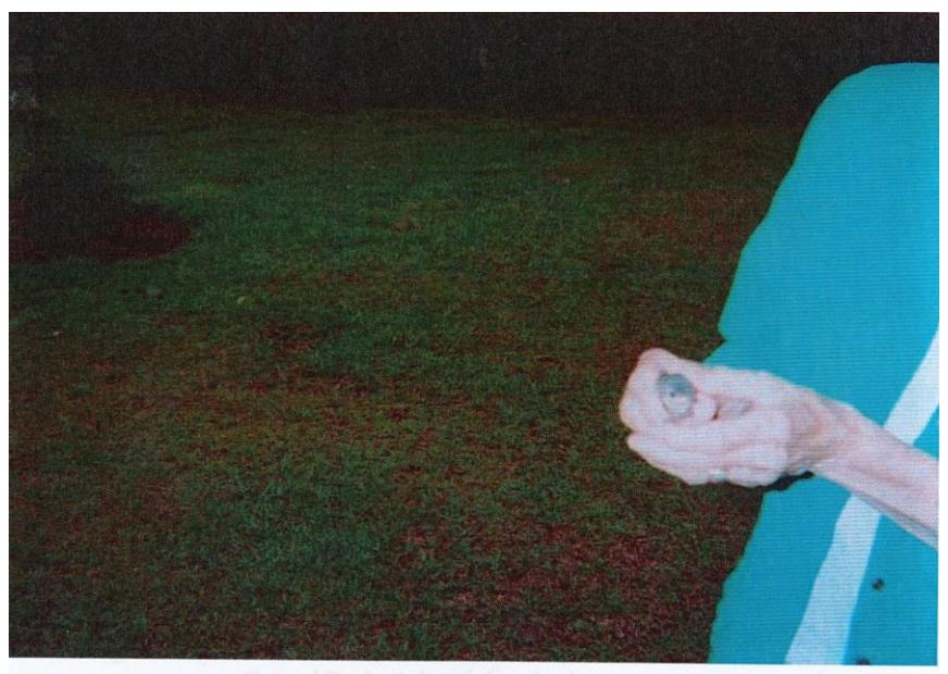
"Mrs. Human" holding the sweet little bird who was never afraid of them.