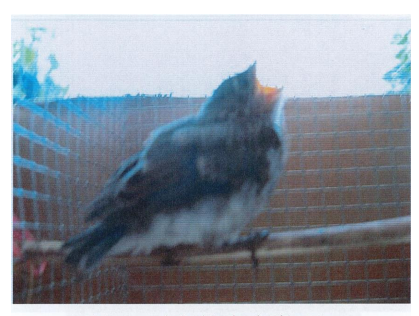
Our sweet baby bluebird, Blue Boy.