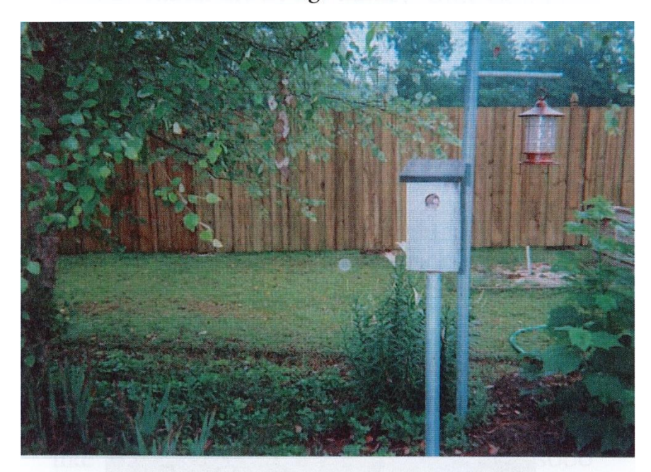
What a precious bird! He seemd to love being in his own house, even with the three eggs that didn't hatch.