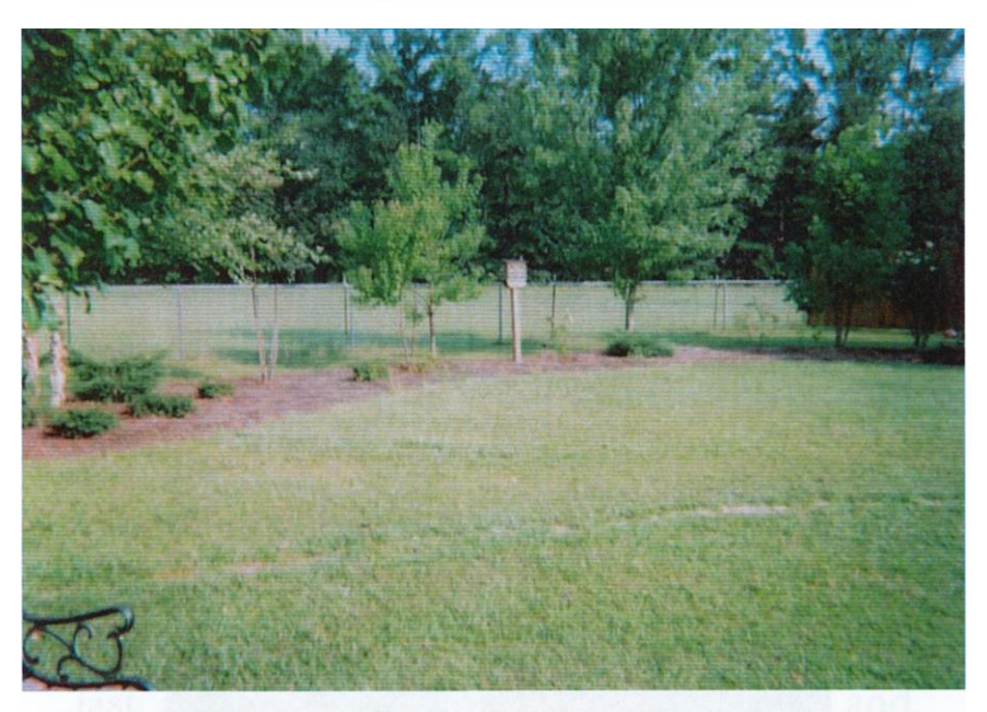
The pasture beyond the fence where Blue Boy crossed the third time we turned him loose. Look closely on the right side of the birdhouse. There is a bluebird on top.