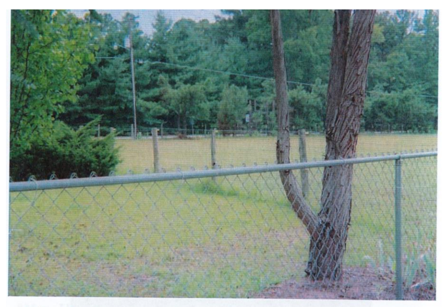
Blue Boy flew from the eucalyptus tree to the the third fence post with a bug in his mouth. The top of the post is about 4" wide. (That post has a small dot on it to mark it in the picture.)