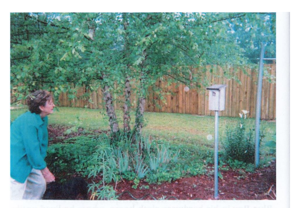
Blue Boy's "Kind Mrs. Human" watching him closely in his nest.