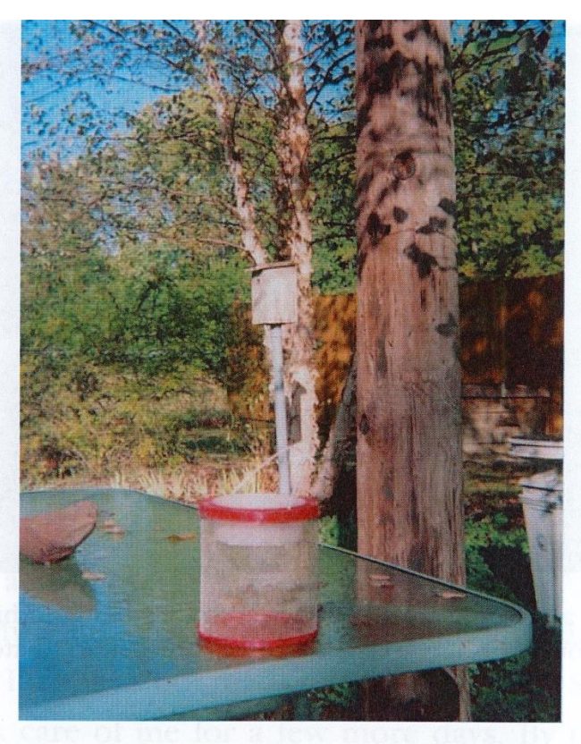
Our neighbor's cricket box, which is mentioned in the story. Also, there is another bluebird house in the background.