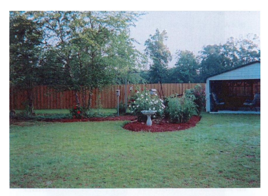
Blue Boy's house where he was hatched. (The birdhouse on the post under the limb of the birch tree.)