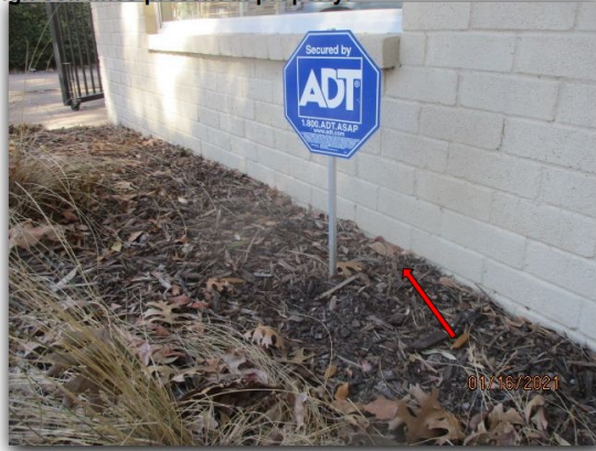
High soil lines present at property.