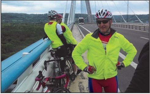
Pont de Normandie

Day three (Monday) was slightly different in that the only thing really left to do was cycle over to Le Havre for the afternoon ferry back to Portsmouth. However, rather than taking the most direct option (15m), the time available opened up the opportunity to 'put a loop in' and take a short tour of