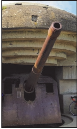
Batterie allemande de Longues sur Mer

Our second day in France dawned wet and overcast although we had spent the previous early-summer evening 'rehydrating' and relaxing at a local restaurant. Bayeux is a very pleasant city with a stunning cathedral and medieval style architecture; however there wasn't much time for looking around during our brief stay. The itinerary for day-two was a lot less pressured though, with the plan to spend the day time sightseeing and working our way along the