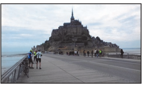
A quick detour to Mont. St. Michel

Naturally, we'd been keeping an eye on the weather for about a week beforehand and thankfully the rain on Friday night had