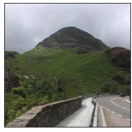
Day 8 Crawford, Biggar to Loch Lomond (85 mile)