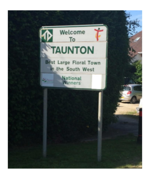
Day 2 Callington to Taunton (85 mile) – very hilly and hot again!