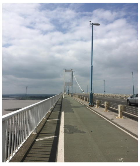
Day 3 Taunton to Monmouth, (85 mile) – Cycling over the Severn Bridge