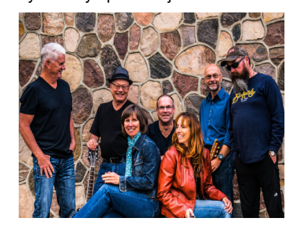
May 7 VIBRAM SOULS $10 cover

You can bring an instrument, sing a song or two, or just sit and enjoy some music at our family friendly open mic jam session.