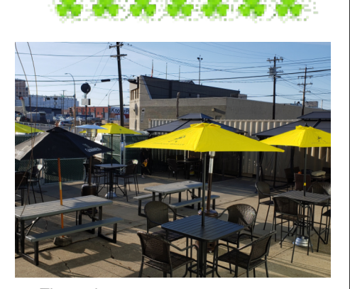
The patio will open at the end of May.

All the Executive contact information is listed on the back of this page.