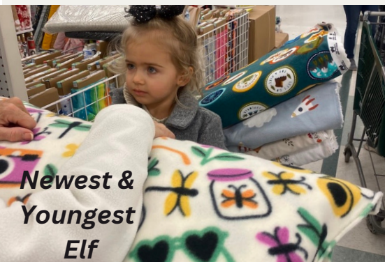
Newest & Youngest Elf

I know that the Elks are always happy to see us arrive with our trailer of goodies. And while I still think they are trying to figure out why we go to Maine from TN; I am thrilled that because of many caring and generous individuals, we are continuing to make a difference in a community that needs our generosity and caring. Thank you for making 2023 a huge success and I look forward to seeing what we can do in 2024.