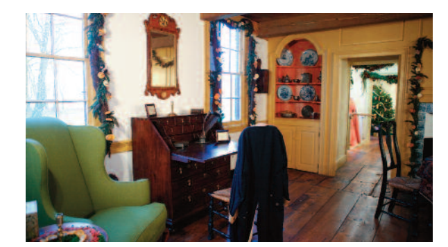
The Vanderveer Parlor