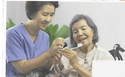
Reminders to brush teeth