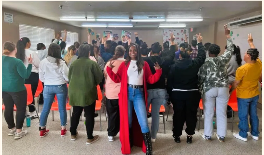
Speaking at Casa Aurora