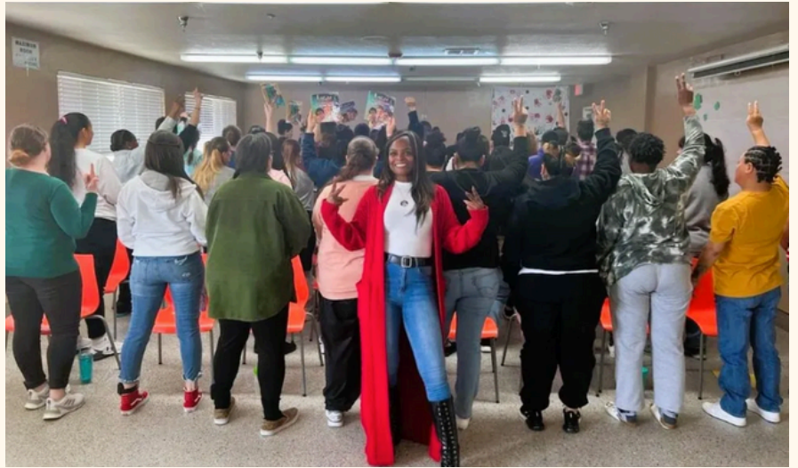
Speaking at Casa Aurora

"We would like to formally thank you for dedicating time to speak with the participants at Casa Aurora- CCTRP Bakersfield. Our program is a Corrections to Community Transitional Re-entry Program providing gender – responsive and trauma informed services to offenders who are reintegrating back into society. Through your courage, shown by sharing your journey to wholeness through trial and triumph, you empowered our participants to begin rewriting their story, owning their history, and take charge of their future through resilience and persistence. You encouraged them to celebrate their small wins, which is an essential step to personal freedom. Our participants continue to talk about how relatable you were and how you've inspired them to be a better version of themselves, despite what their past looks like. We look forward to having you come back soon to continue pouring into our participants." - Casa Aurora Family, sent two months after the event