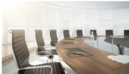
Small Meeting room