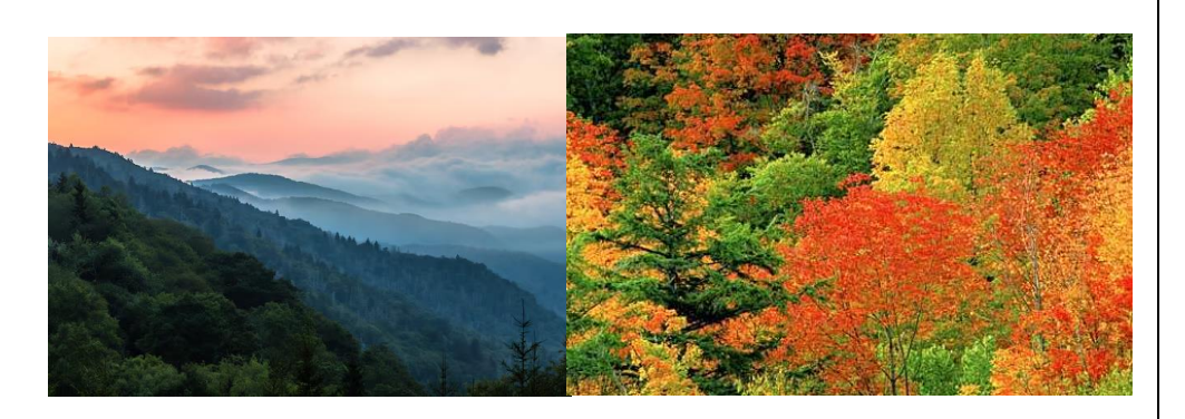
... the mountain scenery and fall colors