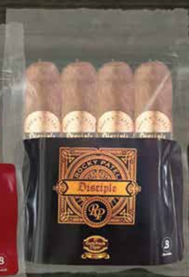
Rocky Patel Disciple Half Corona