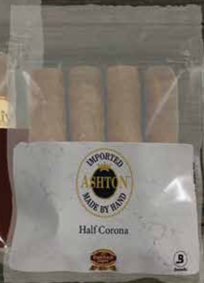
Ashton Half Corona