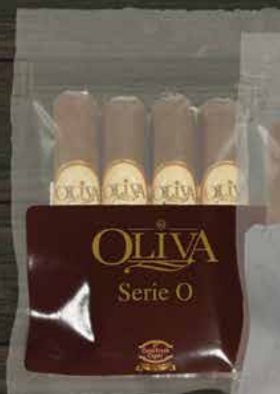
Oliva Serie O Habano #4