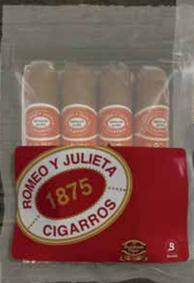
Romeo y Julieta 1875 Petite Bully