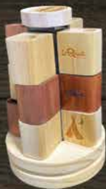
Custom Cigar Holder