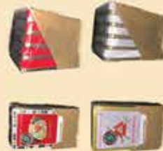
ROMEO Y JULIETA RESERVA REAL MINUTOS PETITE

The convenient 6x33 Ginos Petites size allows you to enjoy the fine flavor of Reserva Real whenever the day may take you, even when you're short on time. Count: 6 x 5