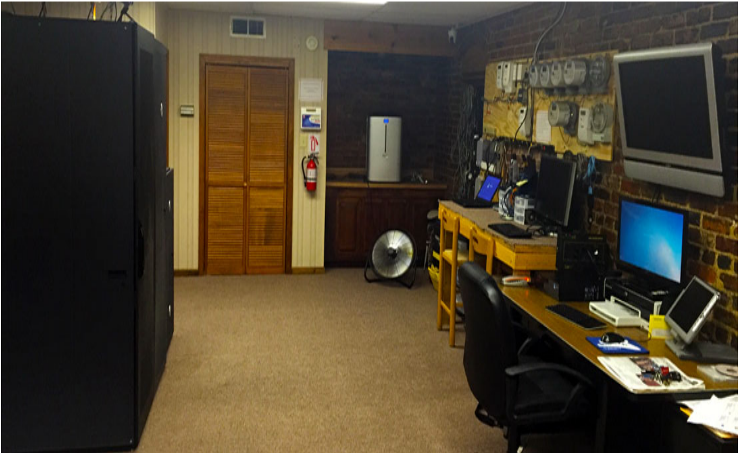
GRID MICRO LIMITED'S SMART AMI ELECTRIC METER LAB