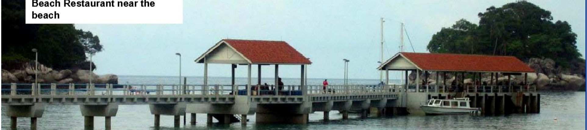
Most basic necessities are available there