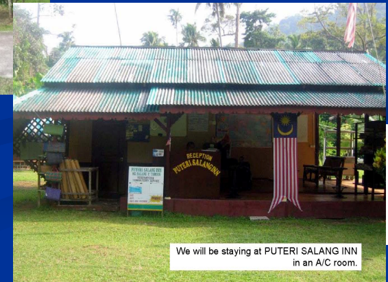
We will be staying at PUTERI SALANG INN in an A/C room.