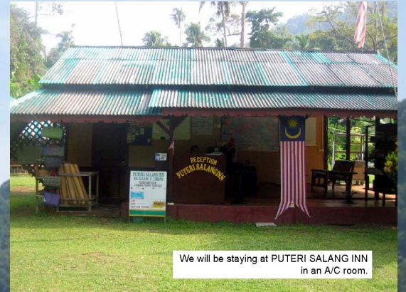
We will be staying at PUTERI SALANG INN in an A/C room.