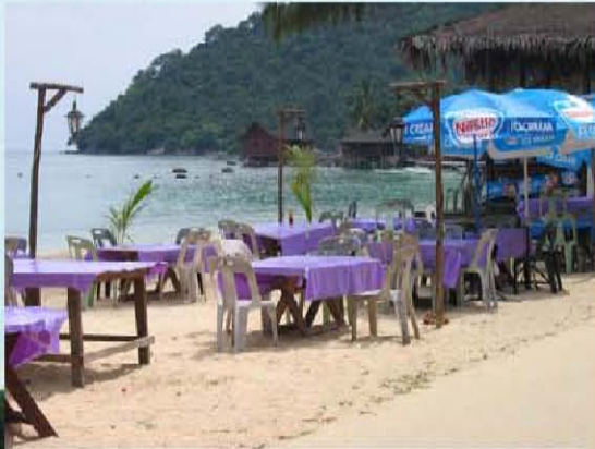
Beach Restaurant near the beach