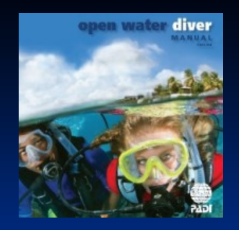
E CARD CERTIFICATE