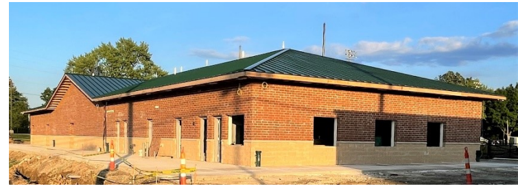
June 12, 2022