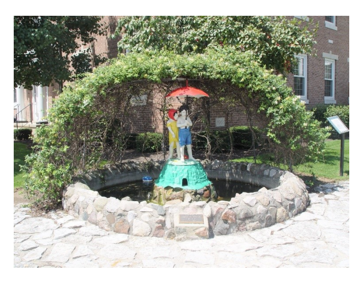
Page 6 View at corner of the current Greenville City building and on SIU campus: