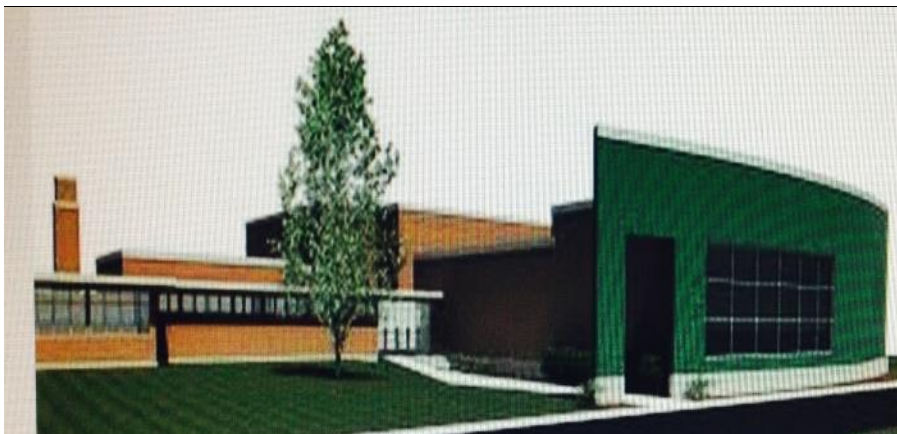
Greenville High School , Cafeteria extended toward street

39 members of the Class of 1994 held their 20 th year Class Reunion at the Old Arcana Eating House in Arcanum, August 2, 2014.