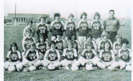
1979 Girls' Softball SWBL Champions