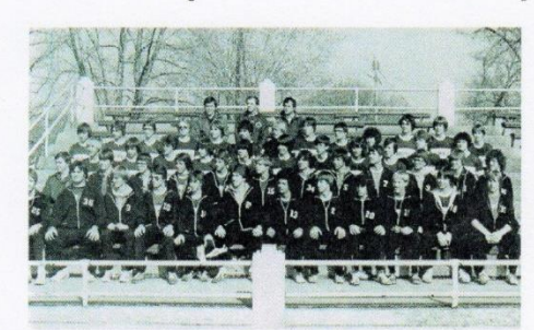
1979 Boys Track SWBL Champions