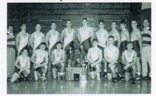
1994 Wrestling GMVC & Sectional Champions