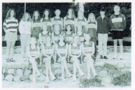
1994 Cross Country GMVC & District Champions