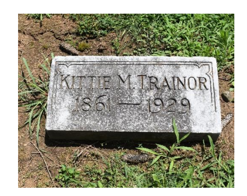
Page 9 TRAINOR TOMBSTONES IN THE GREENVILLE UNION CEMETERY