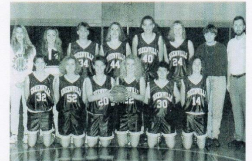
1994 Girl's Basketball GMVC & Sectional Champions