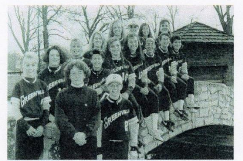
1994 Girl's Softball GMVS & District Champions