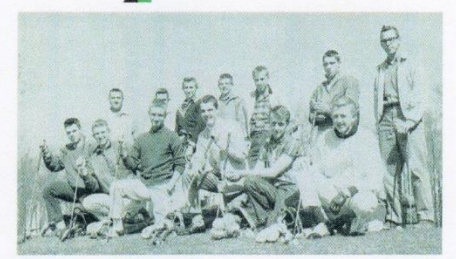
1959 Boys Golf MVL Champions & State Runners Up