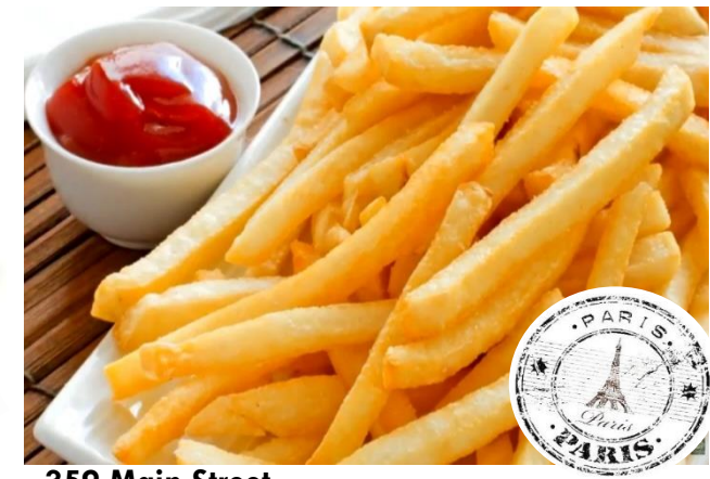
359 Main Street Gallaway TN 38036