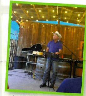
Preaching in the barn at the campground