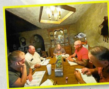
Bible study in the house at the campground