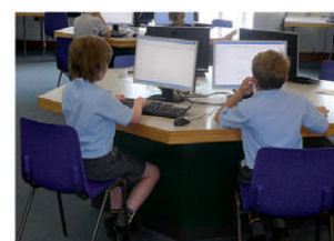
An online interview session for the Sound Bites project, in which some of the questions were piloted