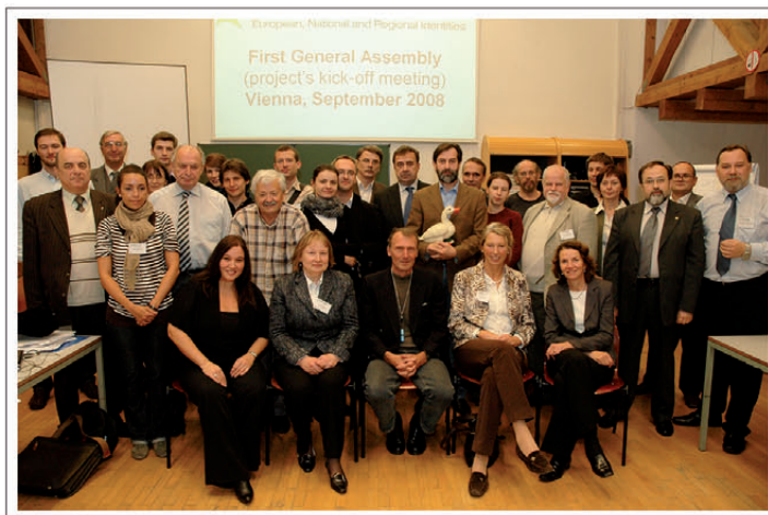
ENRI East kick-off conference, 26. September 2008, Vienna

We work closely together to acquire new knowledge and achieve a deeper understanding of the interplay of European, national and regional identities evolving along the new eastern borders of the European Union.