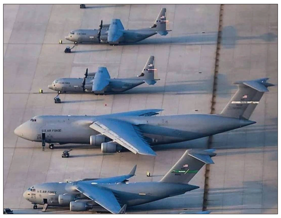
Figure 2. C-130, C-5 and C-17 Comparison

102 troops or 170,900 pounds of cargo.<sup>432</sup> One C-17 reportedly carried over 800 passengers to Al Udeid airbase in Qatar.<sup>433</sup>