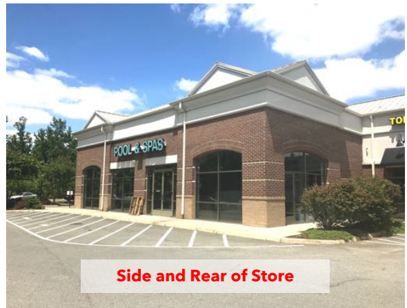
Side and Rear of Store