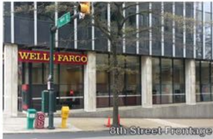
8th Street Frontage