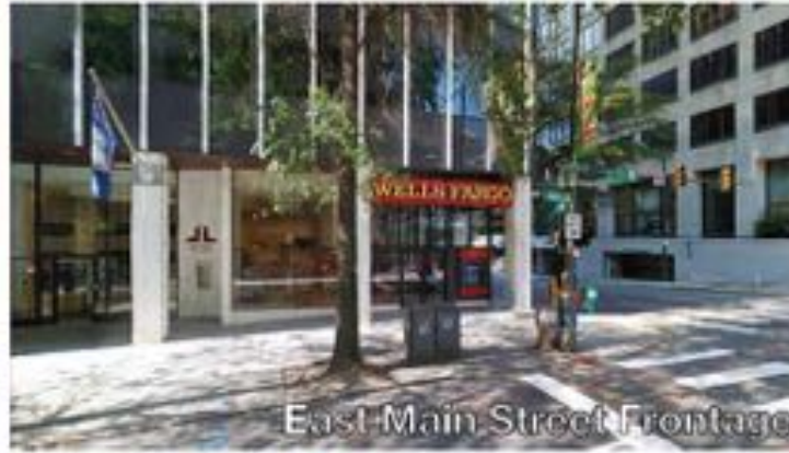
East Main Street Frontage