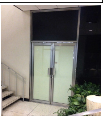
Lobby entrance for 2,200 SF retail space

Main Street entrance for 2,200 SF retail space