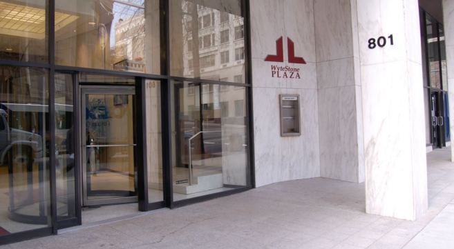
Wytestone Plaza Main Street entrance