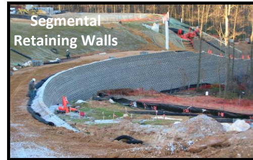
Segmental Retaining Walls