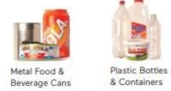
Metal Food & Beverage Cans