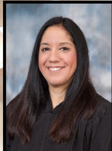
Ventura County Family Law Judge Michele Castillo