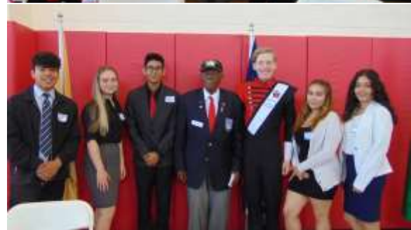
Each vet speaks with two separate groups of students.