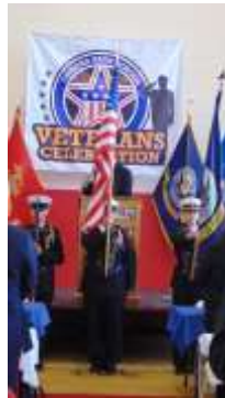
Presentation of colors by Navy JROTC