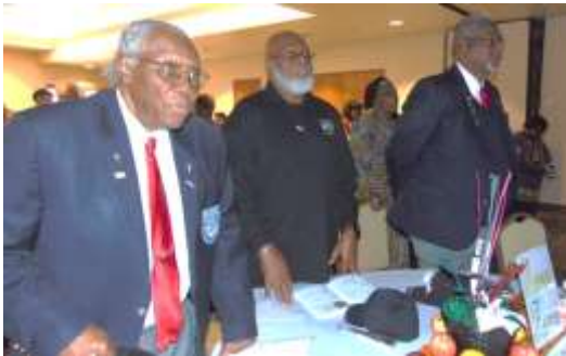
Standing for Lift Every Voice and Sing