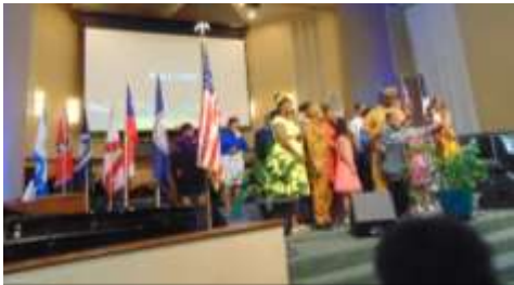
Flags from different countries represent African and African American roots.

On Saturday, February 16 th , members of the Buford A. Johnson Chapter of the Tuskegee Airmen attended services at the Kansas Avenue Seventh Day Adventist Church in honor of their African American Celebration. Members of the church often celebrate history or the military and have invited us to many events during the years.