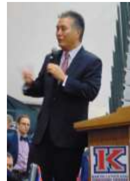
U.S. Congressman Mark Takano