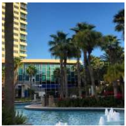
In September, we will return to Altura for our meetings.

The early registration deadline for the TAI 2017 convention has been extended to June 30, 2017. After that date, the registration fees will go up. The convention will be held in Orlando, Florida from August 3<sup>rd</sup>-5<sup>th</sup>, 2017 at the Hyatt Regency Orlando Hotel. You can register online by going to Tuskegee Airmen, Inc. Convention 2017.